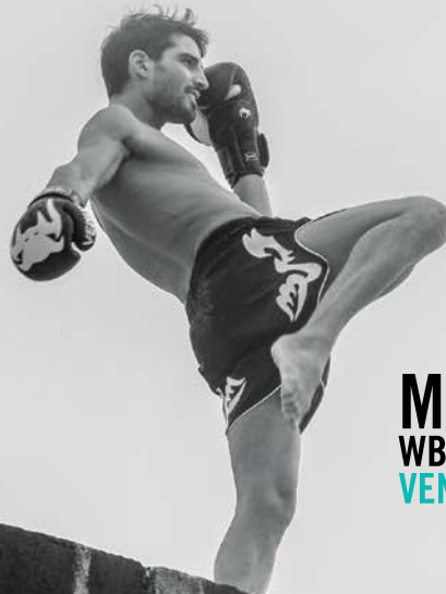
MEHDI ZATOUT WBC WORLD MUAY THAI CHAMPION VENUM ATHLETE